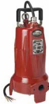
Sump, Sewage and Effluent Pumps