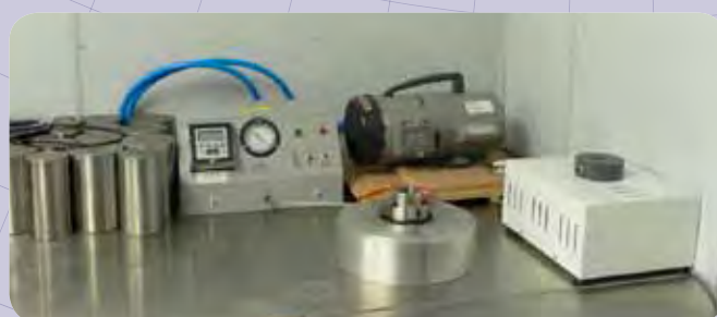
Vacuum testing facility.