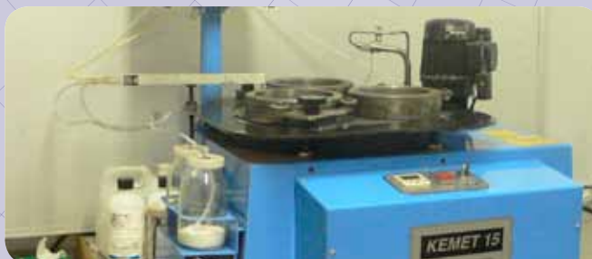
Multi station lapping machine.