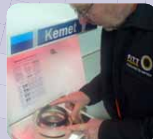
Checking seal face flatness using a monochromatic flatness tester.