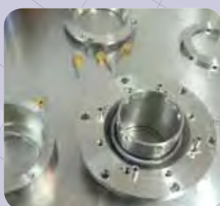
Strip survey of Chesterton mechanical seal.